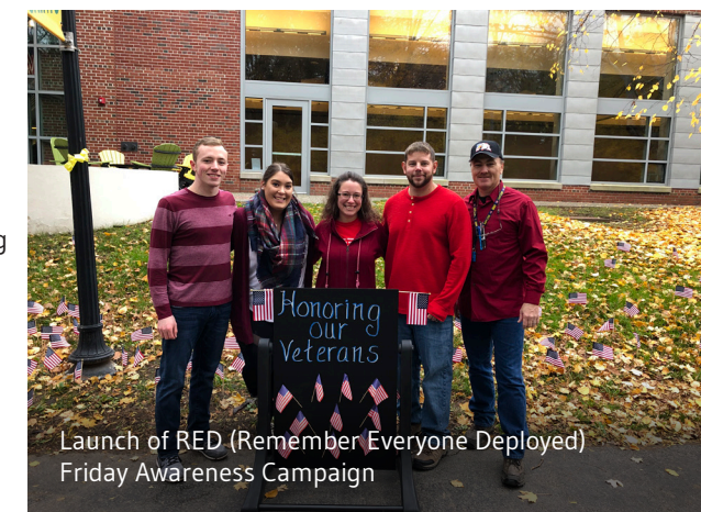
Launch of RED (Remember Everyone Deployed) Friday Awareness Campaign