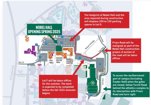
Nobel Hall Map