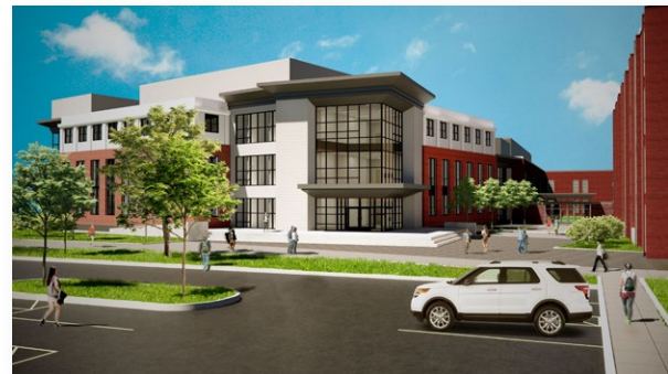
Nobel Hall Rendering