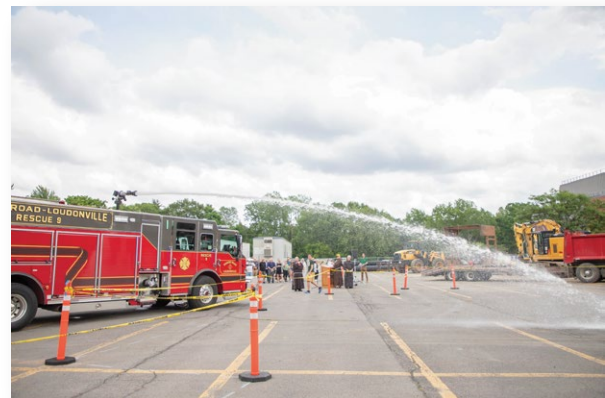
Nobel Hall Blessing