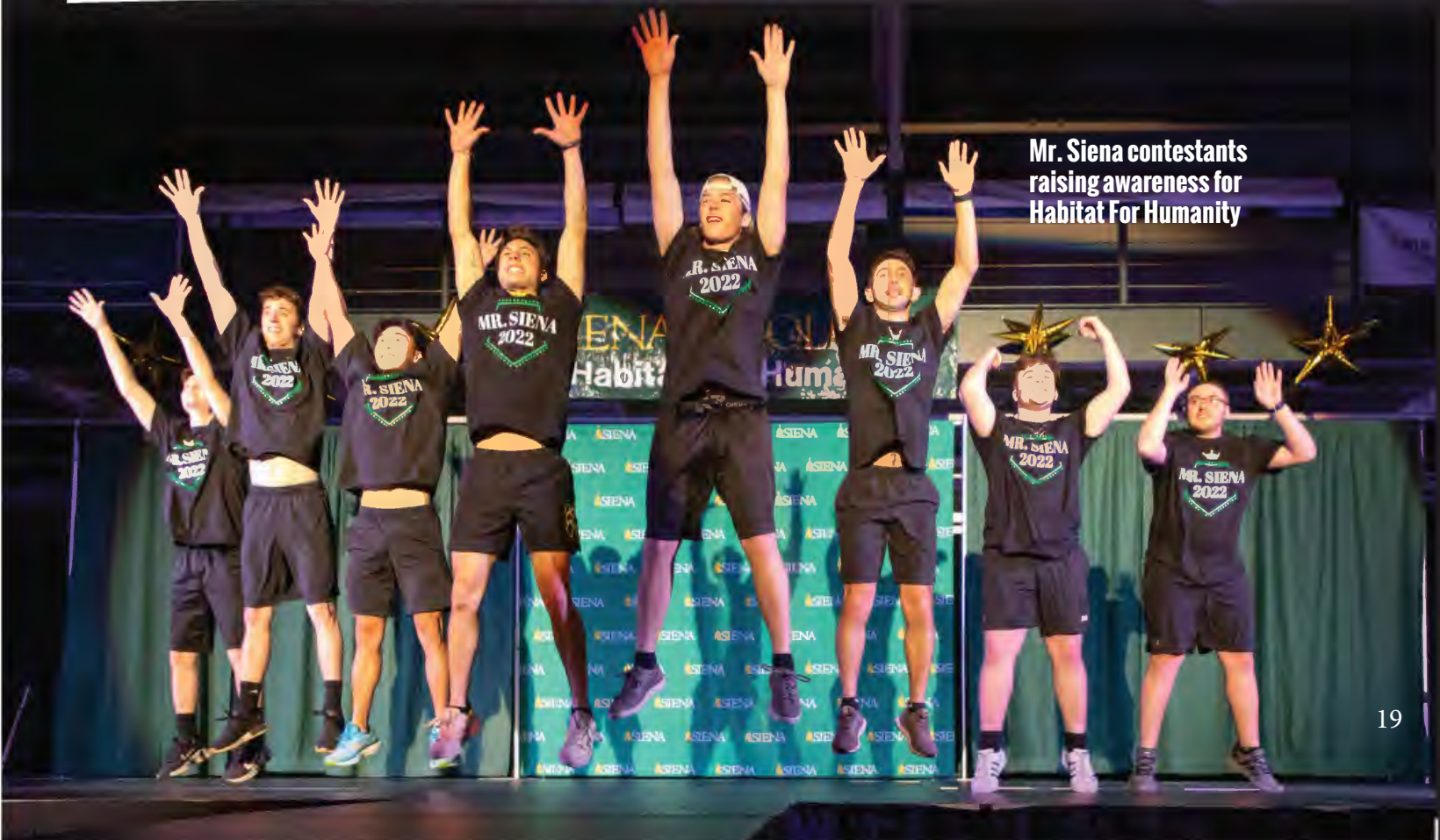
Mr. Siena contestants raising awareness for Habitat For Humanity