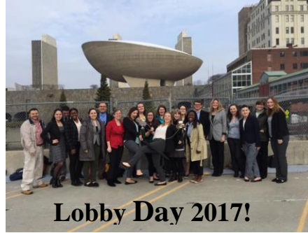
Lobby Day 2017!